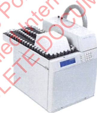
Figure 3. Headspace Analyzer