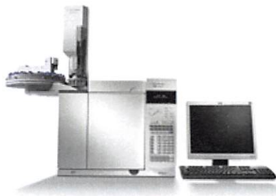
Figure 2. Gas Chromatograph